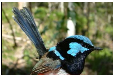
Superb Fairy Wren

Cuckoo, Fan-tailed Cuckoo, Horsfeld's Bronze Cuckoo-shrike, Black-faced Currawong, Grey U Fantail, Grey Fly-catcher, Restless* V&D Mistletoebird Pardalote, Spotted U Pardalote, Striated Shrike-tit, Crested* V Shrike-thrush, Grey Silvereeye Sitella, Varied Thornbill, Brown D Thornbill, Striated Thornbill, Yellow-rumped D Tree-creeper, White-throated D Whistler, Golden Whistler, Rufous D